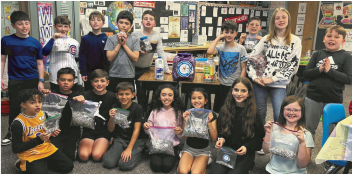
4th Grade RE Students and pop tabs they collected for Ronald McDonald House Charities

The Religious Education office would like to thank all of our program volunteers who generously contribute their time, talents, and treasures. These volunteers include catechists, classroom aides, special event coordinators, security staff, and office staff. We are so inspired and grateful for all you do.